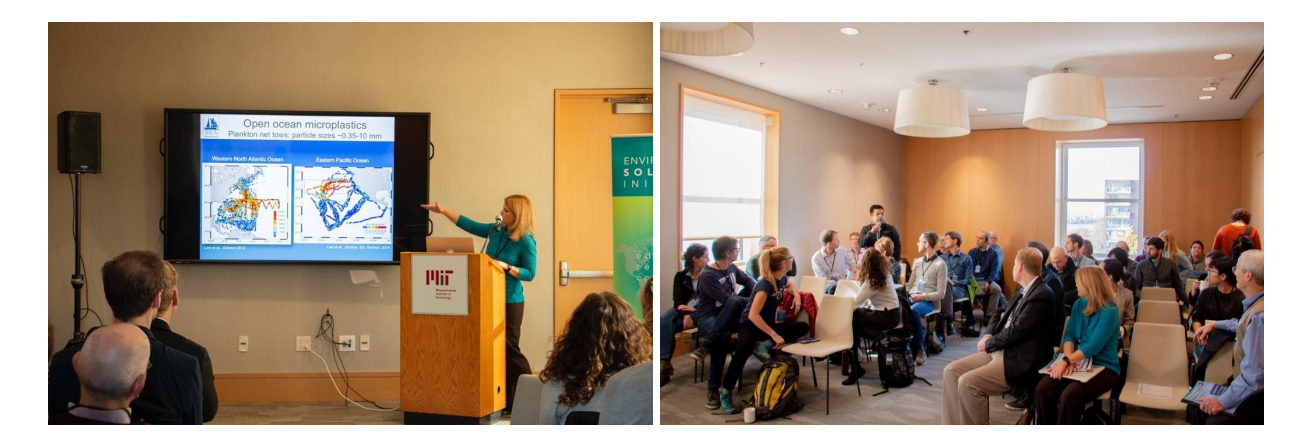
Keynote presentation at "Modelling Plastics in the Oceans"

In November 2019, we hosted a 3-day workshop, Modelling Plastics in the Oceans , to present new findings and exchange ideas with colleagues from the <u>Woods Hole Oceanographic</u> <u>Institution</u> and the <u>Worldwide Universities Network</u>. We identified new avenues for collaboration to better model the behavior of microplastics in oceans and other waterways