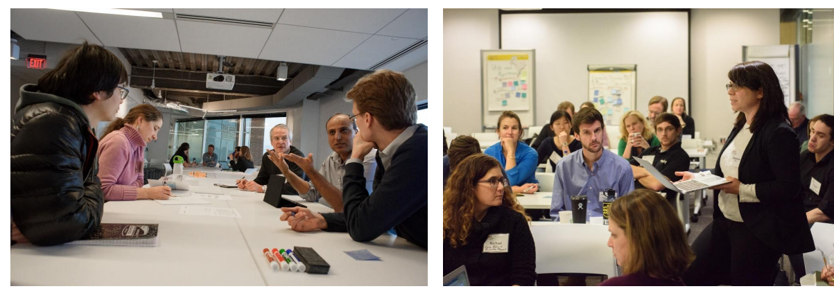
Breakout session at ESI-CPE launch workshop

ESI-CPE began with a 1-day workshop in January 2018 that brought together 80+ faculty, students, industry, government agencies, policy-makers and other domain experts to discuss the current state of knowledge and activity concerning plastics in the environment.